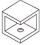
SOLID ORNAMENT (Fits Profile #97)

Nielsen corner ornaments easily slip over joined moulding corners on the #97 and #99 profiles only. Simply slide over corner, tighten screw, and you're done!