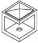
PYRAMID ORNAMENT (Fits Profile #97)