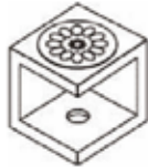
FLORAL ORNAMENT (Fits Profile #97)