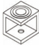
ROSETTE ORNAMENT (Fits Profile #97)

See Pages C-8, C-9, C-10 For Hardware Prices